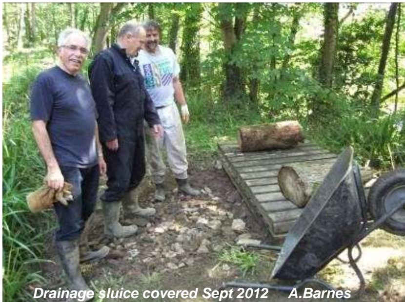
Drainage sluice covered Sept 2012 A.Barnes