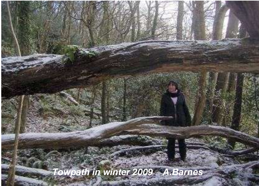
Towpath in winter 2009 A.Barnes